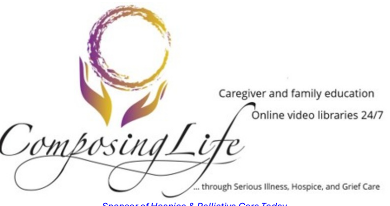
Sponsor of Hospice & Palliative Care Today

Dallas-based Steward plans to cut 753 workers at Carney Hospital in Dorchester and 490 employees at Nashoba Valley Medical Center in Ayer on Aug. 31, according to two Worker Adjustment and Retraining Notification Act filings.