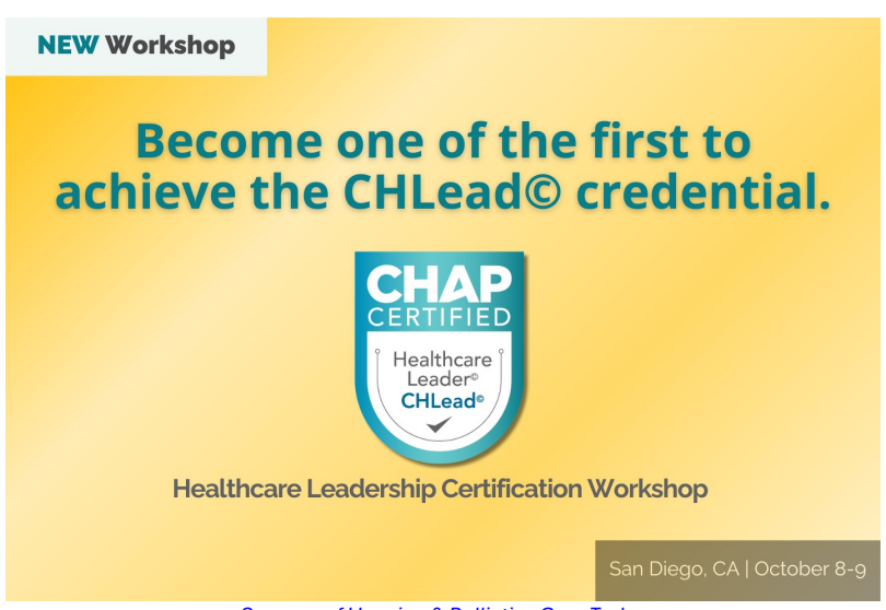
Sponsor of Hospice & Palliative Care Today

Is the experience of losing a loved one associated with accelerated biological aging? In a cohort study of 3963 participants from the National Longitudinal Study of Adolescent to Adult Health, nearly 40% experienced the loss of a close relation by adulthood. Participants who had experienced a greater number of losses exhibited significantly older biological ag es compared with those who had not experienced such losses. These findings suggest that loss can accelerate biological aging even before midlife and that frequency of losses may compound this, potentially leading to earlier chronic diseases and mortality.